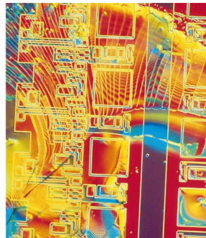
An early stored-program computer (left), built around 1950, used vacuum tubes in logic circuits, whereas modern computers use transistors and silicon wafers (right), but both are based on the same principles.

that a cell receives from its environment can influence which genes it expresses — and thus which proteins it contains at any given time — or even the rate of mutation of its DNA 13 , which could lead to changes in the molecular structures of the proteins. This is in contrast to physical systems where, typically, macroscopic perturbations or higher-level structures do not modify the structure of the molecular components. For example, the existence of vortices in a fluid, although determined by the dynamics of molecules, does not usually change the nature of the constituents and their molecular interactions.